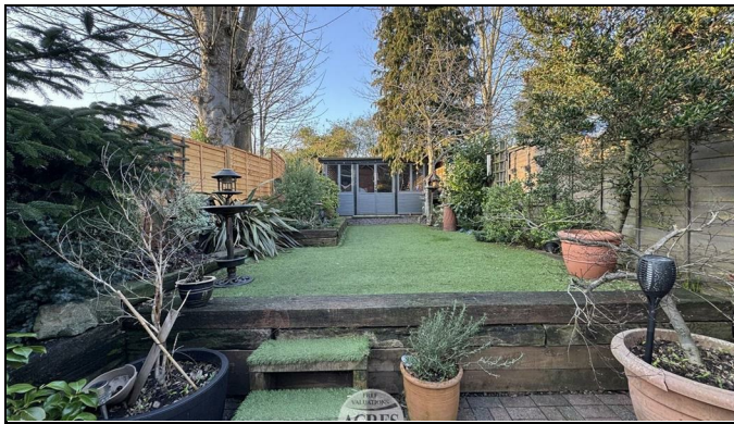
Kings Road, Kingstanding, B44 0UH